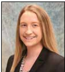
Riley Duckworth Foundation Associate Director

(217) 753-3328 Ext. 106 tyard@illinoisffa.org